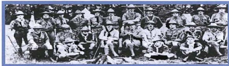
The First Scoutmasters' Course at Gilwell Park, September, 1919. Baden-Powell is seated center in the front row.