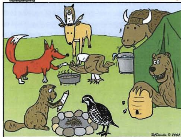
CRITTERS TO WATCH FOR IN THE WOODS