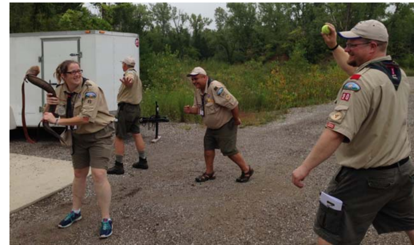
Bobwhite baseball any one?