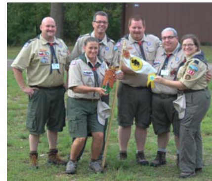
Most Creative Use of Materials!