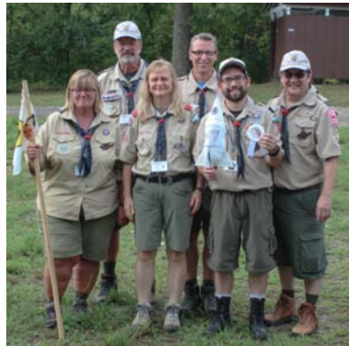
Best Lift Off!