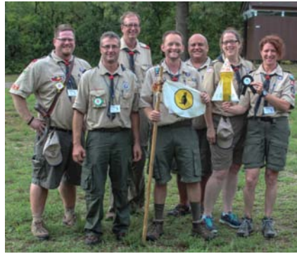
Most Creative Design!